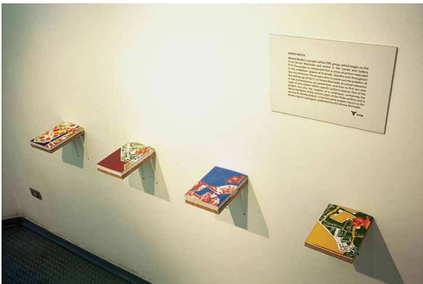
Mixed Media Catalogue

Trie's project MIXED MEDIA started at the 51st Venice Biennale. It consists of a series of actions performed by Trie members in the exhibition spaces in the Arsenale, Giardini and throughout the city of Venice. The project refers to the issue of the biennial's exhibition setting and its actual relevance in contemporary art production; through a series of interventions it explores new ways of articulation within the Biennale's specific context. The project Mixed Media was concluded with the exhibition at P74 Center and Gallery in Ljubljana, where all art pieces made in Venice were shown together with the publication of an artist book (in edition of six) that faithfully reproduces the graphic layout of the official catalogue of the Venice Biennale; along with the documentation of the actions it includes texts written by Dr. Marina Gržinić and us, the authors.