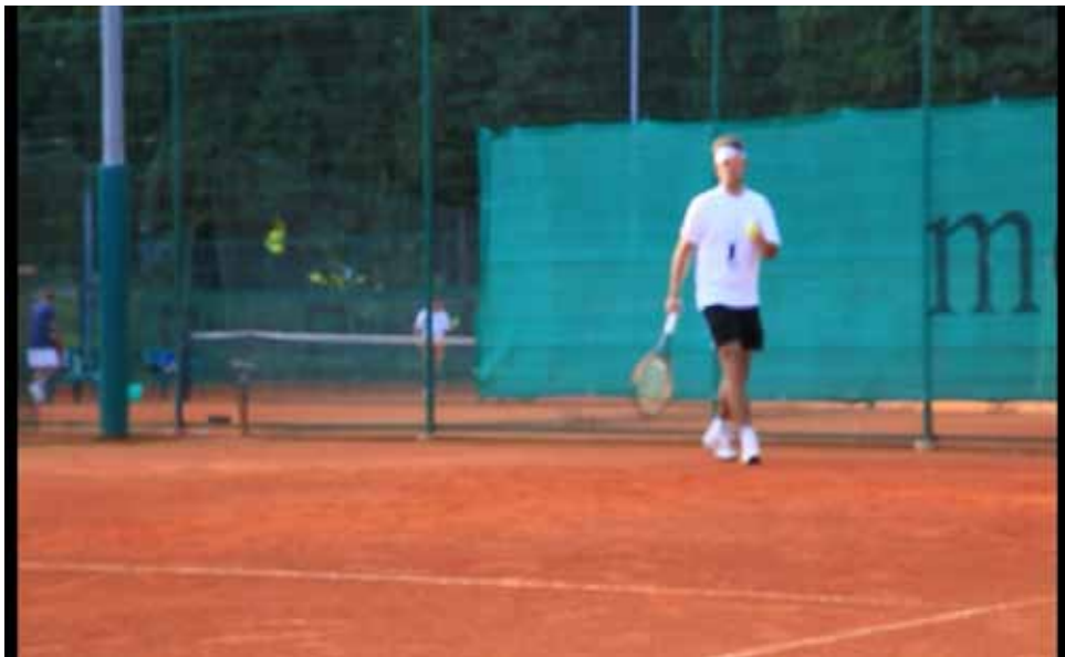
stills from the video